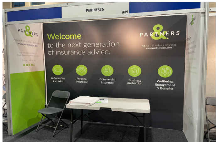
Seamless Stretch Fabric Graphics