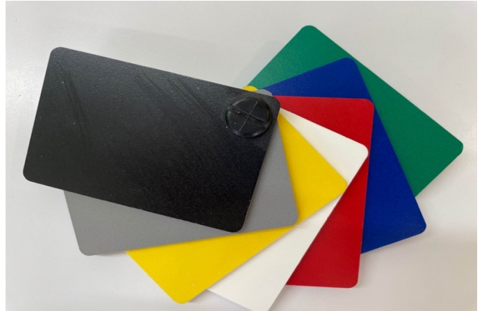
Standard colour wall panel options