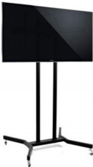
TV & Floor Stand example